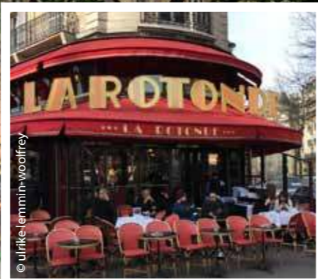
Left: The famous restaurant Le Dôme on Montparnasse boulevard in Paris. Opened in 1898 it was frequented by sculptors, writers and painters Above: La Rotonde in Montparnasse, one of many Parisian cafés that are perfect for people-watching