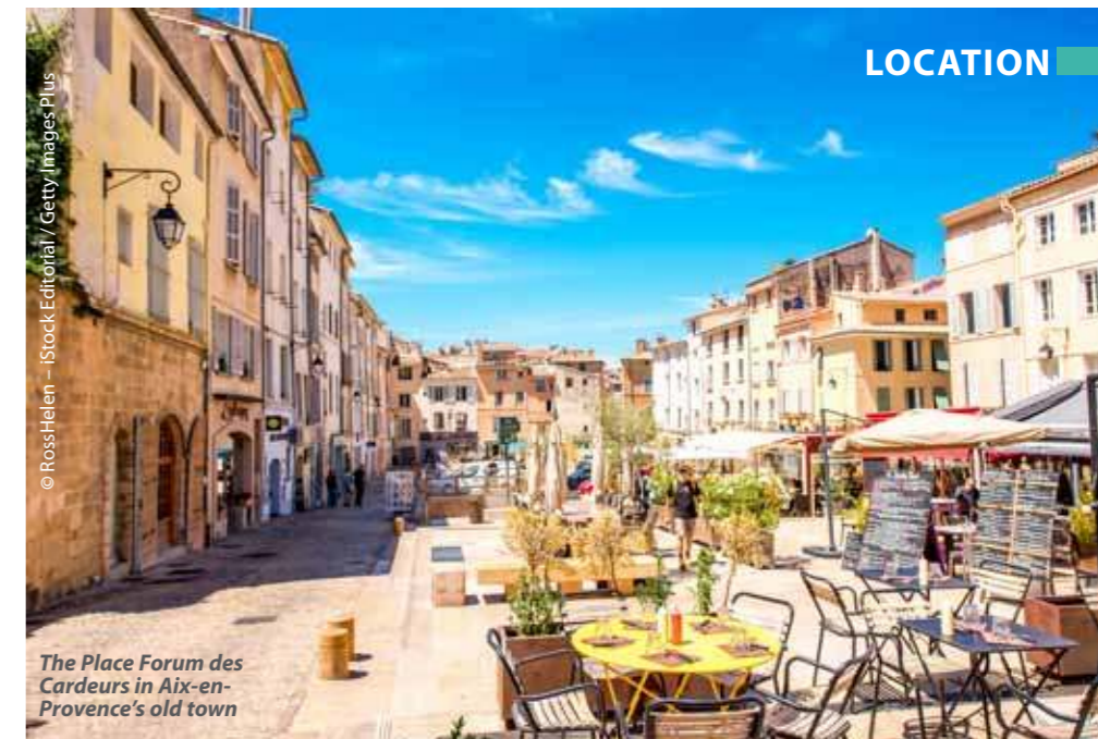
The Place Forum des Cardeurs in Aix-en-Provence's old town